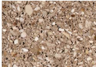
NAVAJO TAN II

Polished units are available in 8 standard colors plus any of Texas Building Products' burnished colors.