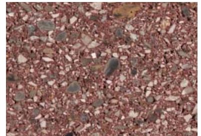
PALO PINTO II